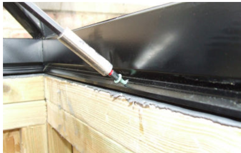
9. Screw the Frameless Lantern down through the holes provided, making sure not to over tighten screws.