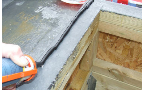
6. Apply a 10mm high bead of compatible sealant to the top edge of the upstand all the way around.