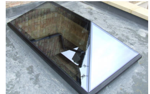
You have now successfully installed your Frameless Roof Lantern / Pyramid.