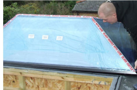
7. Carefully lower the Lantern/ Pyramid into position pressing down firmly for a tight seal.