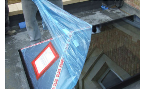
8. Carefully remove glass protection film.